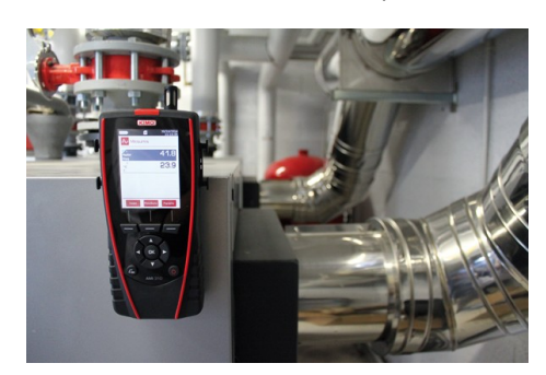
Climatic conditions measurement

AMI 310 SK: portable supplied with a ±500 Pa pressure module, a telescopic hotwire probe with gooseneck, a Ø6 mm Pitot tube, 2 x 1 m of silicone tube, a stainless steel tip