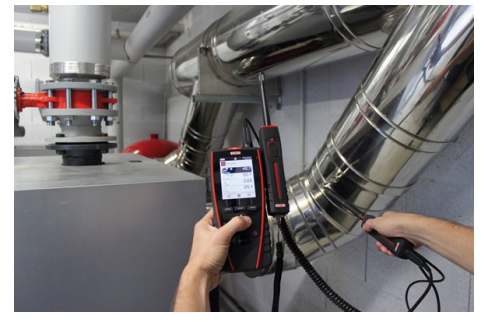
Hygrometry and air velocity measurement